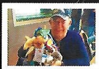
Robin Leach Celebrity Journalist

The World Famous Traveling Shoe, Representing those Suffering from Multiple System Atrophy will be coming to your area!