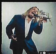
Vince Neil Mötley Crüe