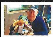
Robin Leach Celebrity Journalist

The World Famous Traveling Shoe, Representing those Suffering from Multiple System Atrophy will be coming to your area!