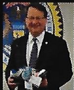
Senator Gary Peters