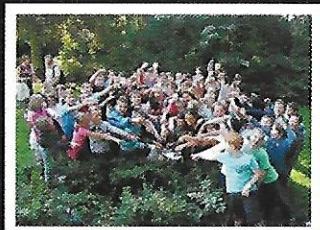
Children in Belgium with the Shoe

Sadly, all the patients pictured (on front) have succumbed to MSA. Please help us honor their memory by posing with the MSA Shoe!