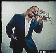
Vince Neil Mötley Crüe