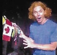
Comedian Carrot Top

Help raise awareness about a rare and fatal disease by posing with the MSA SHOE!