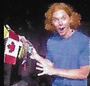
Comedian Carrot Top

Help raise awareness about a rare and fatal disease by posing with the MSA SHOE!