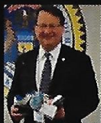
Senator Gary Peters